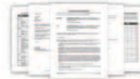
Professional Document Output