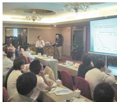
Seminar in Hangzhou