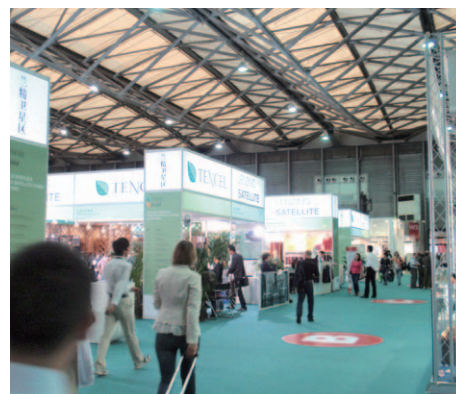
Intertextile Shanghai Apparel Fabrics

Together with our VORTEX PARTNER companies, Muratec will continue to strive to expand the sales of the VORTEX yarn.