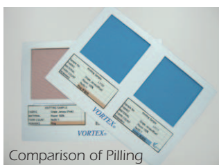
Comparison of Pilling