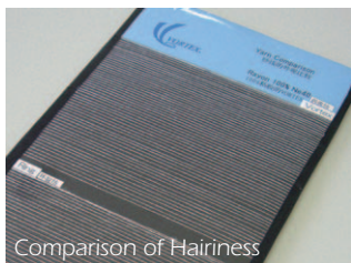
Comparison of Hairiness

To support VORTEX Partners, Muratec is pleased to provide VORTEX sales tool to simply promote VORTEX's advantages. If you have interests, don't hesitate to contact to our VORTEX Sales team!